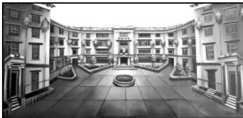
College Building Sketch

Every subject / Department has formed its own Board of Studies as per UGC guidelines. The Boards of Studies are entrusted with the task of formulating / revising the syllabus, initiating and innovating teaching learning methodologies.