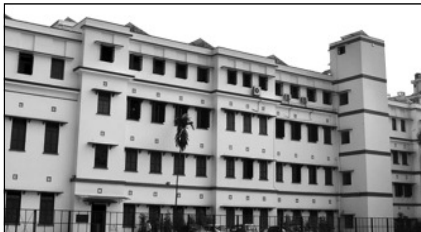
Fr. Verstraeten Central Library

After the last date for the payment of fees, a fine of Rs. 300 for every defaulted month will be added to the defaulter's quarterly fees by the system. Fine will not be waived under any circumstance.