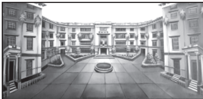
College Building Sketch

Every subject / Department has formed its own Board of Studies as per UGC guidelines. The Boards of Studies are entrusted with the task of formulating / revising the syllabus, initiating and innovating teaching learning methodologies.