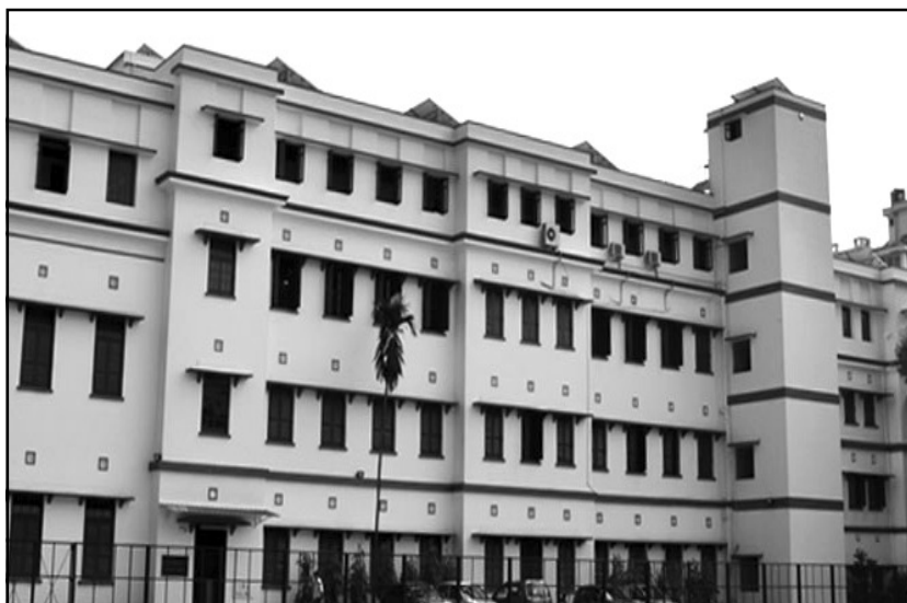
Fr. Verstraeten Central Library

Xaverian Research Colloquium (XRC)-Anusandhan is an endeavor to provide the faculty with an opportunity to discuss their works in progress and to receive feedback from their colleagues on their research. The objective of the Colloquium is to provide a setting and structure that together make possible for each faculty to showcase not only their specialized knowledge but also disseminate new ideas. In addition to supporting and encouraging faculty scholarship, the Colloquium promotes an interdisciplinary dialogue in the college among the members of different departments and offers its members the possibility to "workshop" their projects-in-progress.