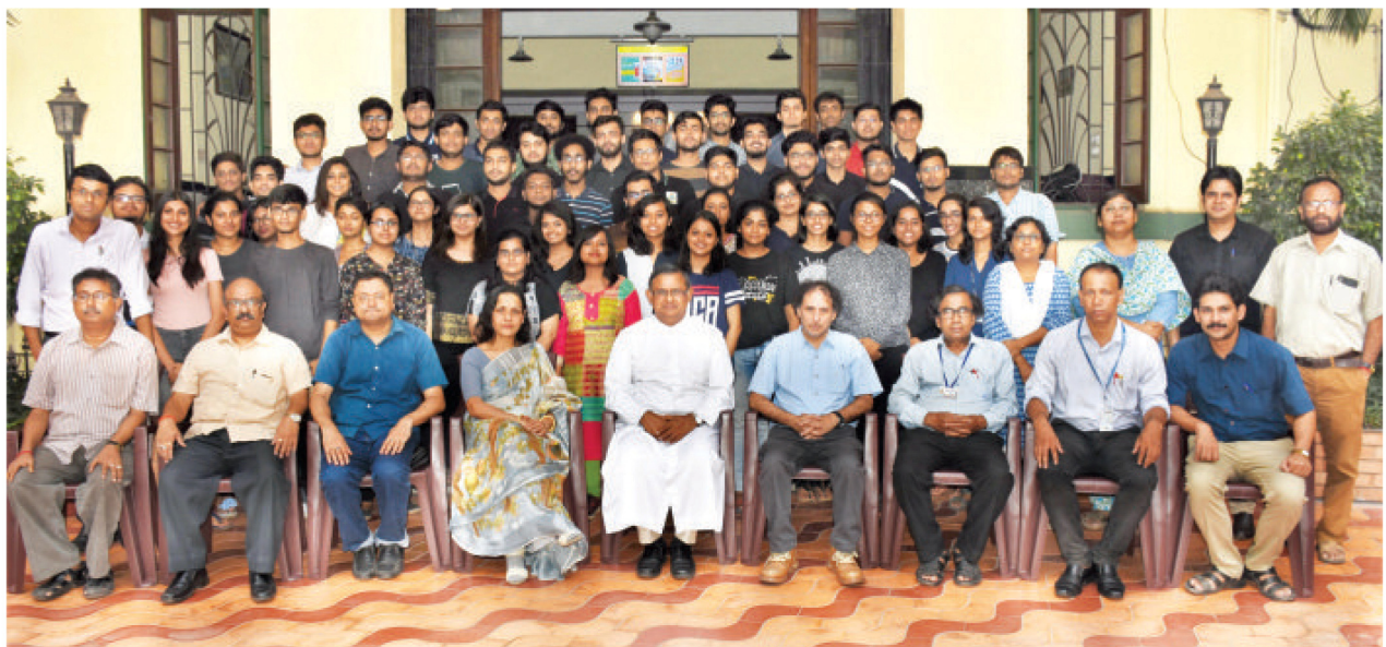
Computer Science, B.Sc.

The Department of Computer Science turned twenty-three this year. The last twenty-two years have been very fruitful and a learning experience for the department. The department is grateful to all the stalwarts who have guided it through thick and thin over the last twenty-two years.