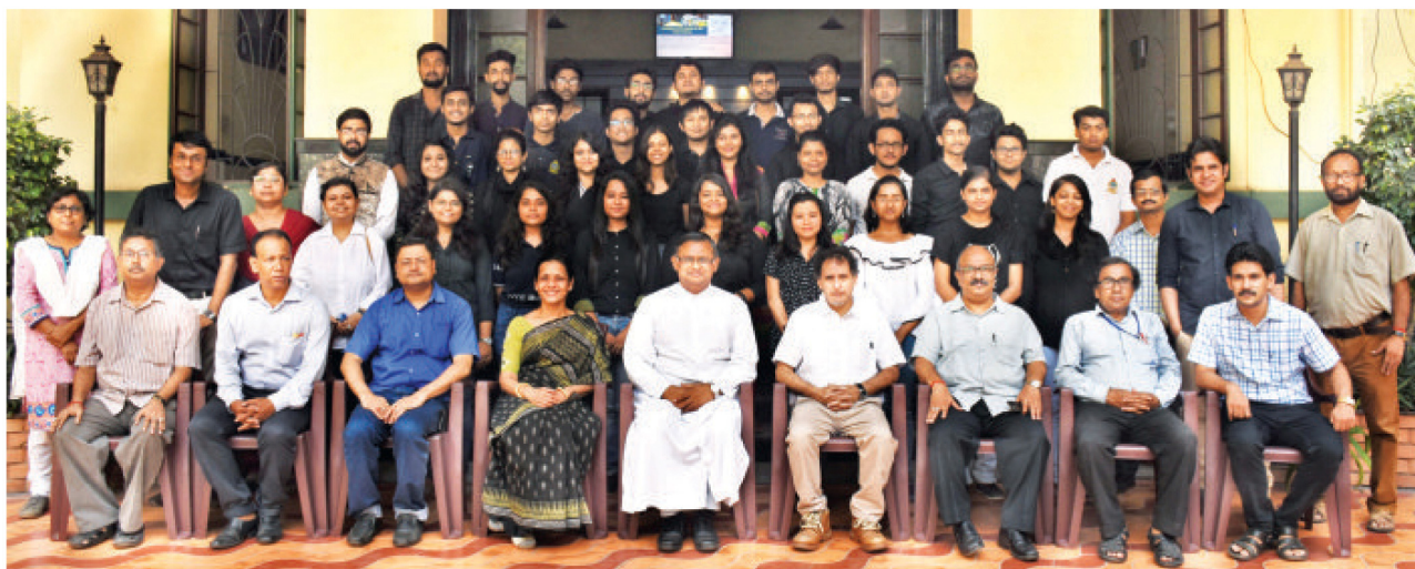
Computer Science, M.Sc.