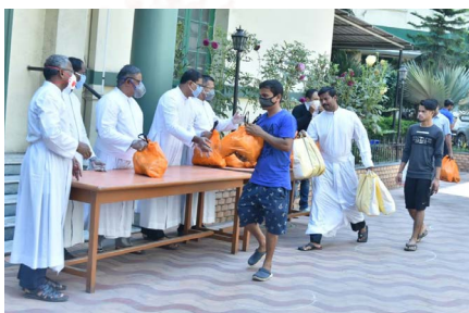
Social Distancing maintained during distribution at St. Xavier's College Park Street Campus