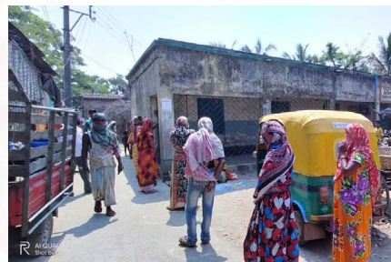
Social Distancing Maintained at Distribution at Paikhala