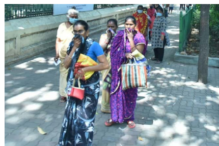
Social Distancing maintained even outside the Main Gate of St. Xavier's College Park Street Campus