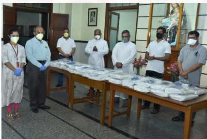
Fathers of St. Xavier's Community offered Prayers before Distribution on every occasion