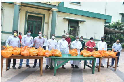
Core Team of St. Xavier's Community Fathers, SXCCAA and ALSOC coming together to distribute the items for the Noble cause