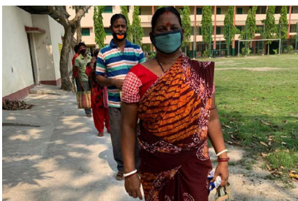
Social Distancing maintained at St. Xavier's College Raghabpur Campus