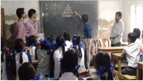
Figure 7.1: Need assessment session