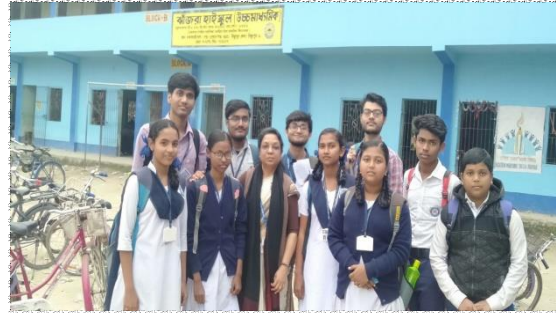
Figure 7.2: XAS members with JHS children