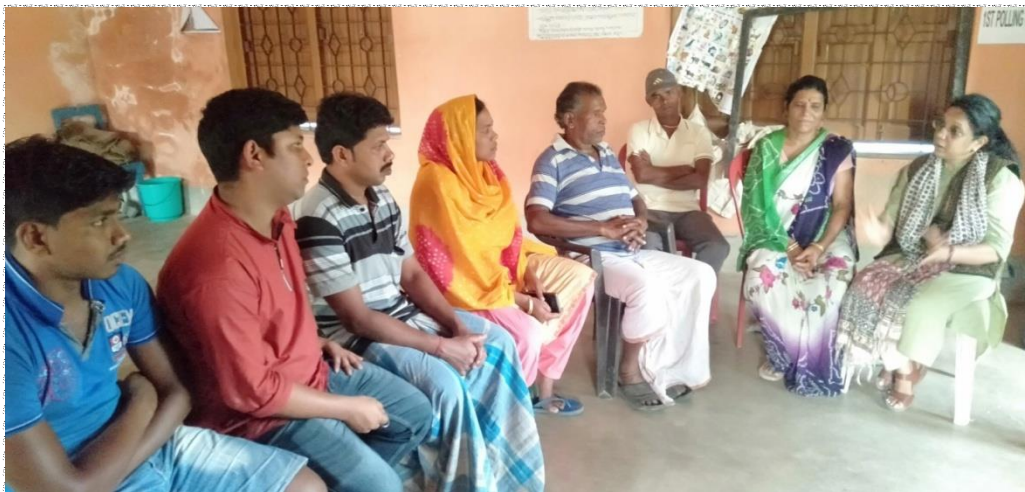
Figure 5.7: UBA Coordinator conducting a meeting with panchayat members and village contact persons in Shalpur village