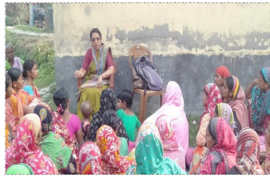
Figure 5.6: VDP meeting at Shalpur