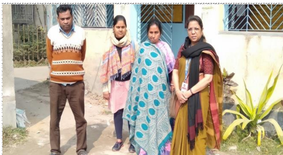
Figure 5.3: UBA Coordinator with the Panchayat Reps. of Bakeswar village