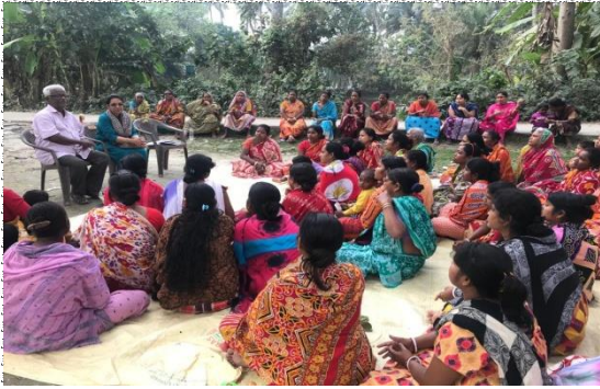
Figure 5.5: VDP meeting at Debipur