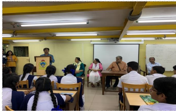
Figure 7.3: JHS teacher expressing his gratitude