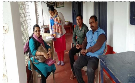
Figure 5.2: UBA Coordinator with Panchayat Representatives of Debipur Village