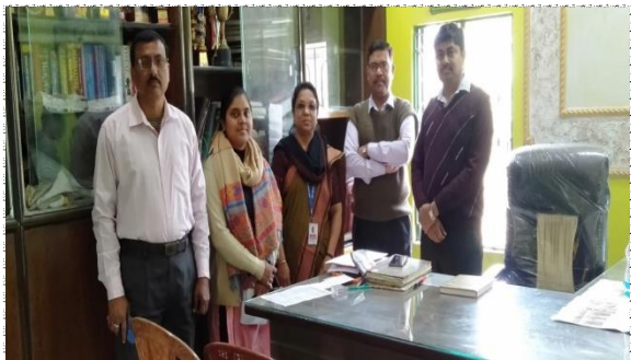
Figure 5.1: UBA Coordinator with Jhanjra High School Headmaster