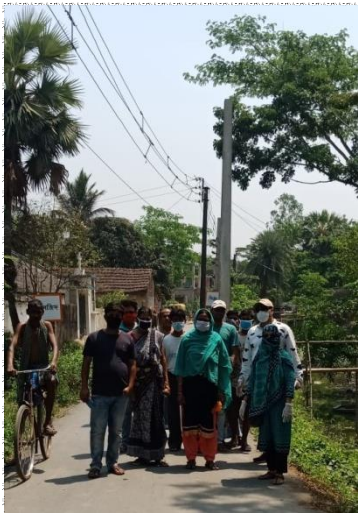
Photo galleria of the relief operations in the villages and from the rural campus

In the Raghampur campus, the long relief work was carried out by the 36 village volunteers from Raghampur area for packing and distributing relief materials. The Panchayat Pradhan of Panuka Panchayat, Kulerdari Panchayat and many Panchayat members and the Nepalgunj Police Force helped the initiatives and supported with all the necessary logistics.