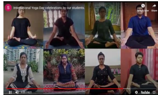
Core Team students observing World Yoga Day