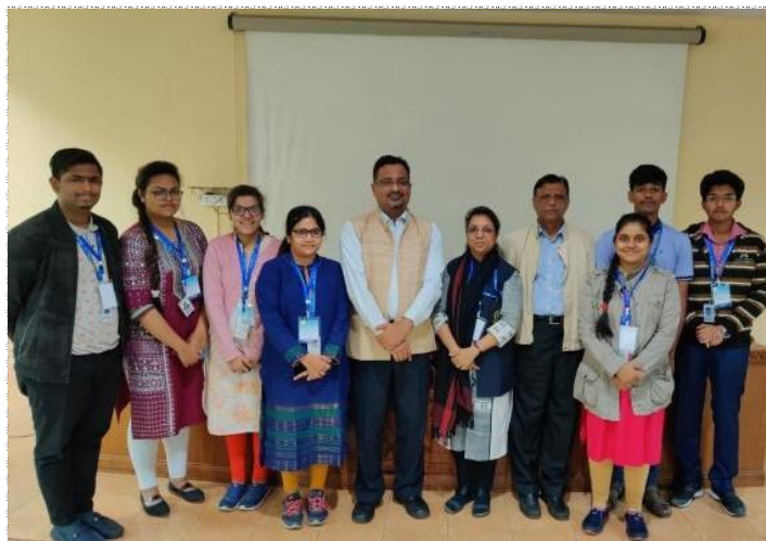
Figure 6.1: UBA core team of St. Xavier's College with the resource person from IIT Delhi