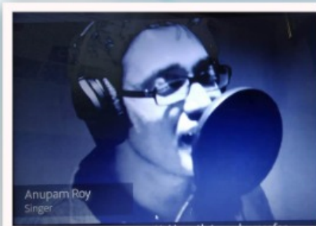
Anupam Roy Singer