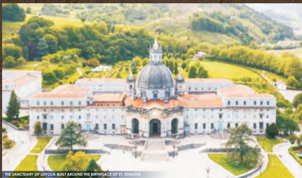
THE SANCTUARY OF LOYOLA, BUILT AROUND THE BIRTHPLACE OF ST. IGNATIUS