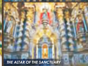
THE ALTAR OF THE SANCTUARY