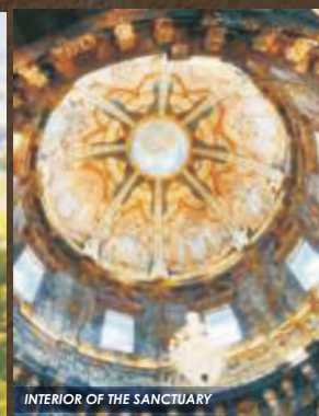
INTERIOR OF THE SANCTUARY