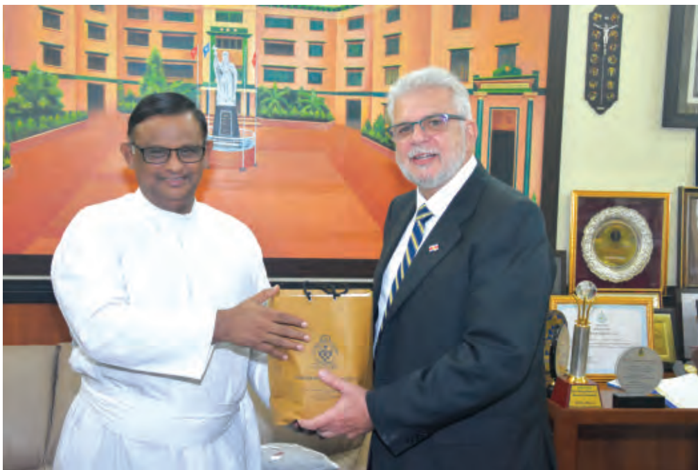
Father with the Ambassador of Costa Rica

Nihil Ultra. There is indeed Nothing Beyond that we will not aspire to and attain.