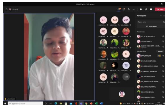
Student sharing about his volunteering experience