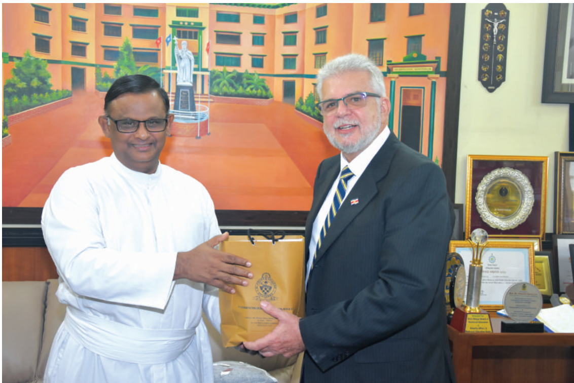
Father with the Ambassador of Costa Rica

Nihil Ultra. There is indeed Nothing Beyond that we will not aspire to and attain.