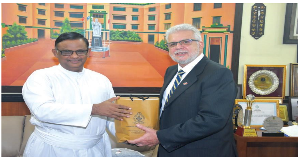
Father with the Ambassador of Costa Rica