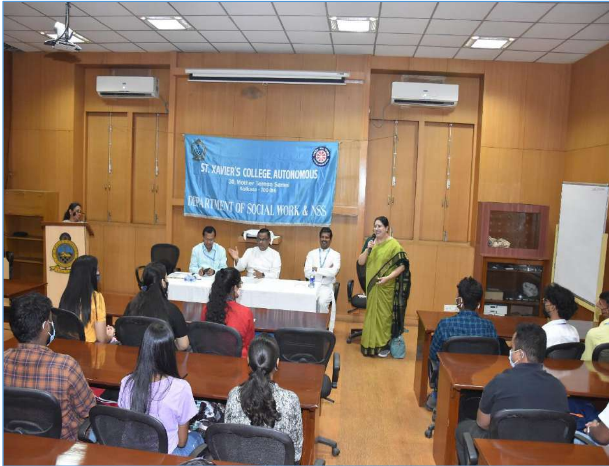
HOD of BA General department addressing the students