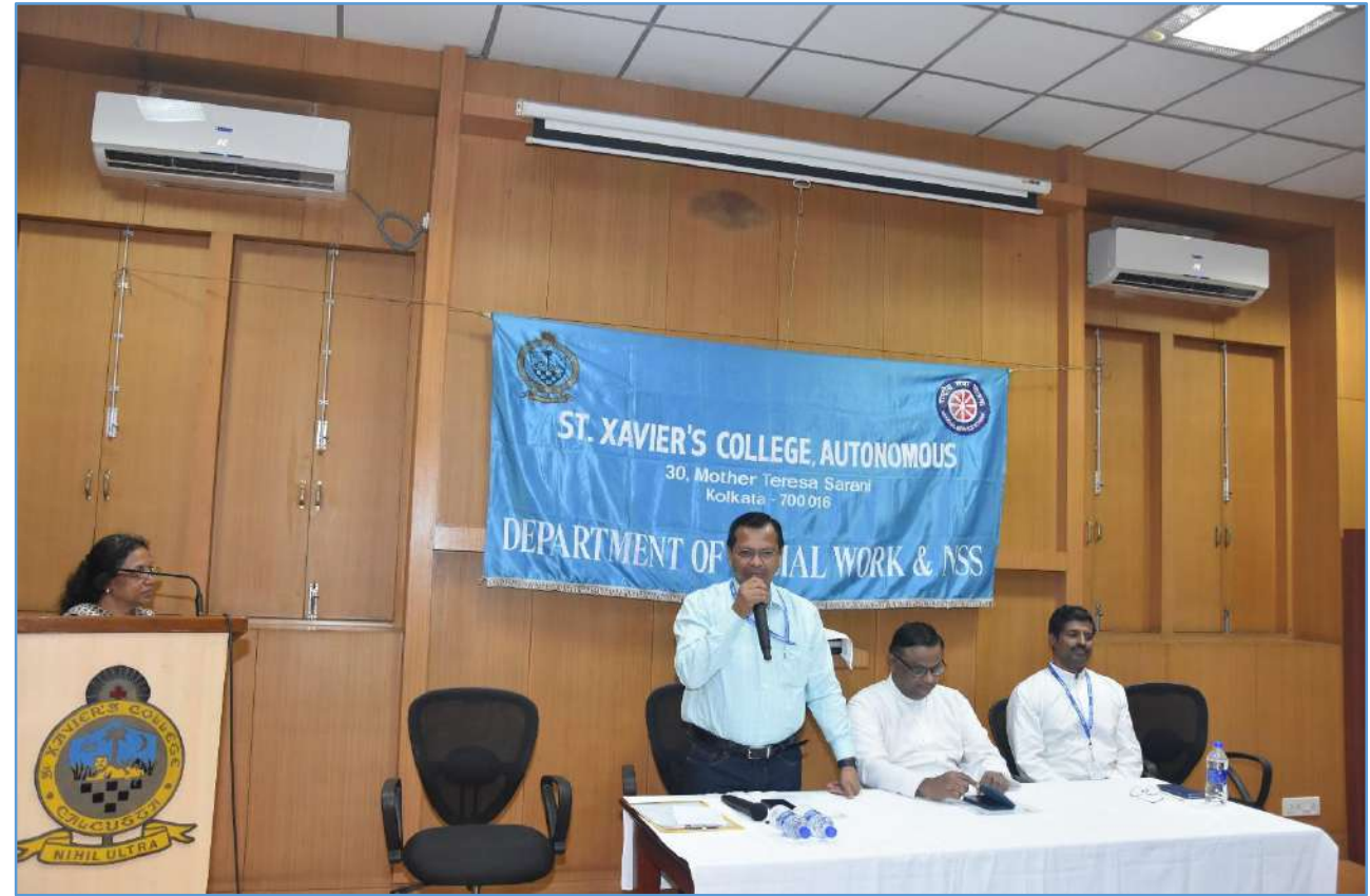
Vice Principals motivating and encouraging the students