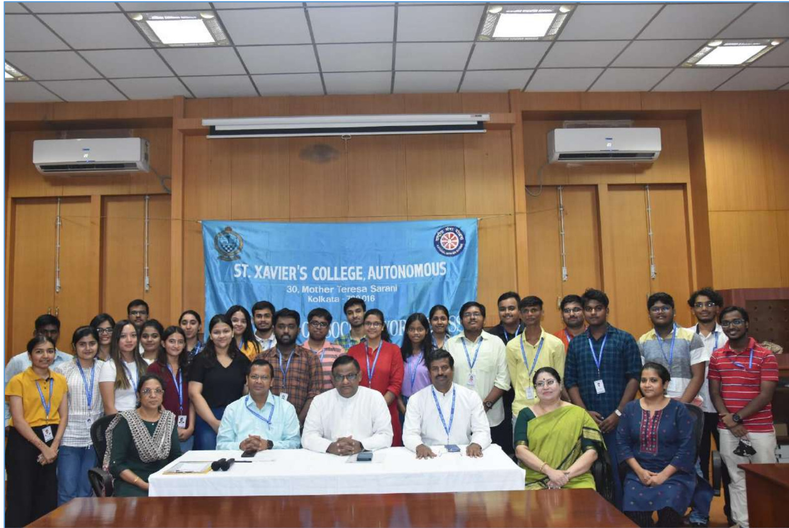
NSS Board, active volunteers with the dignitaries