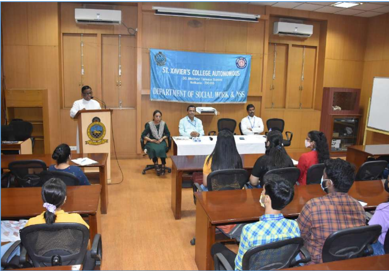
Father Principal declaring the NSS Board 2022-23