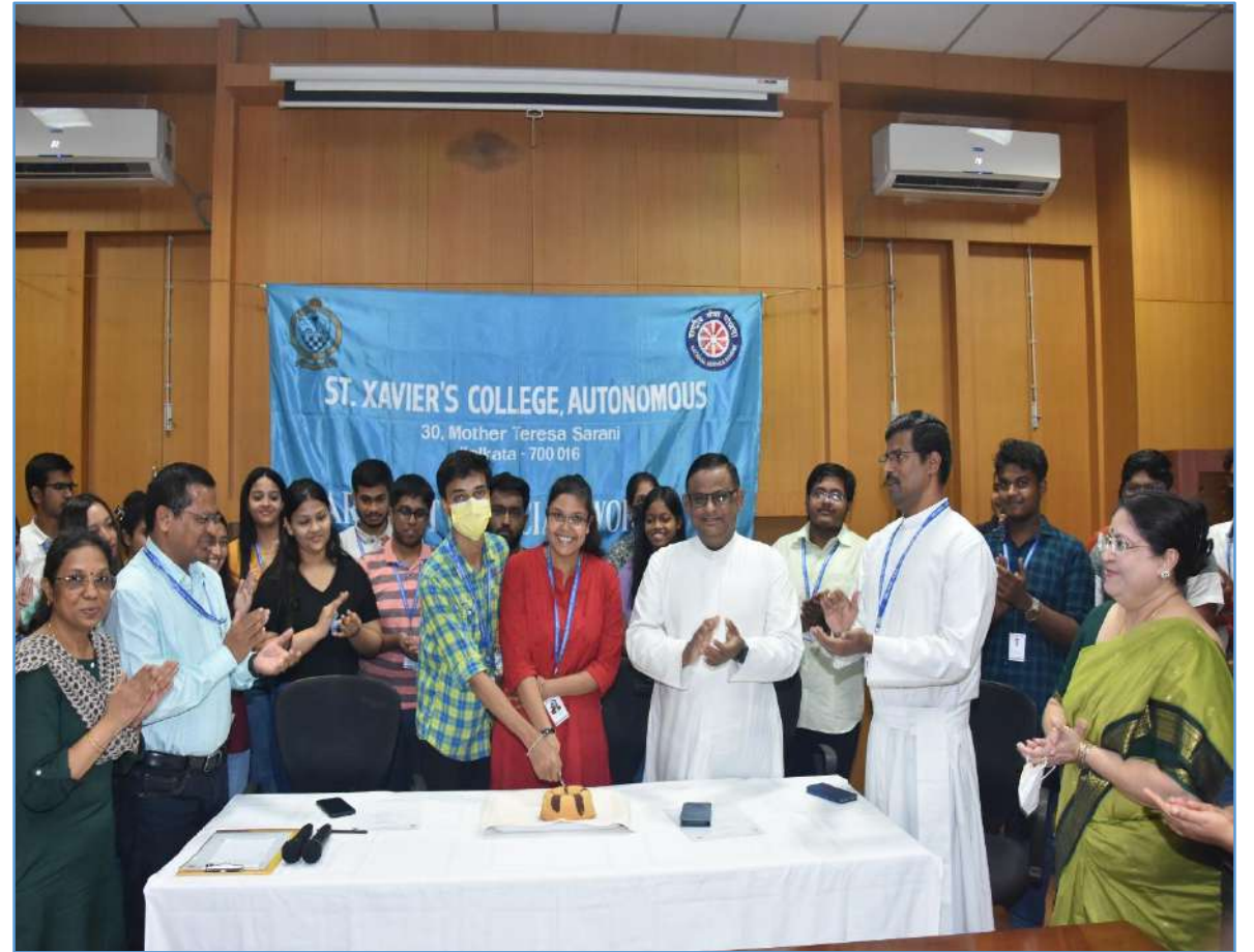
Cake cutting ceremony