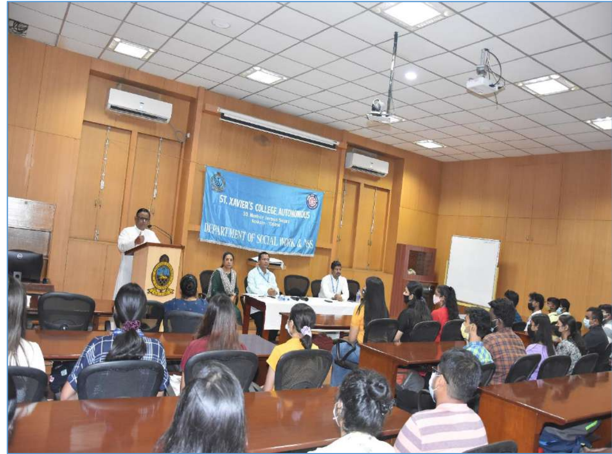
Father Principal sharing about the NSS legacy with the students