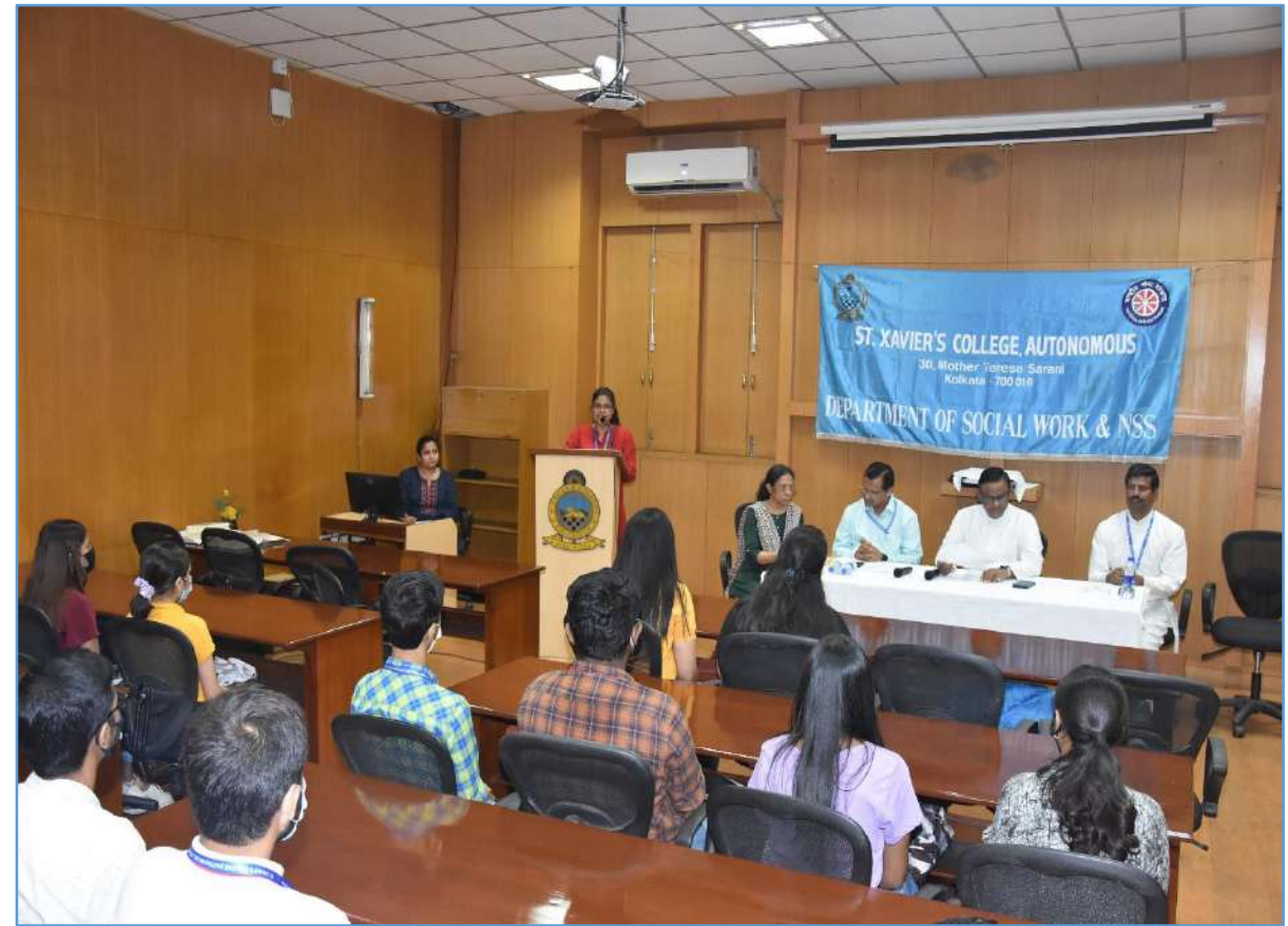
NSS President delivering her acceptance speech