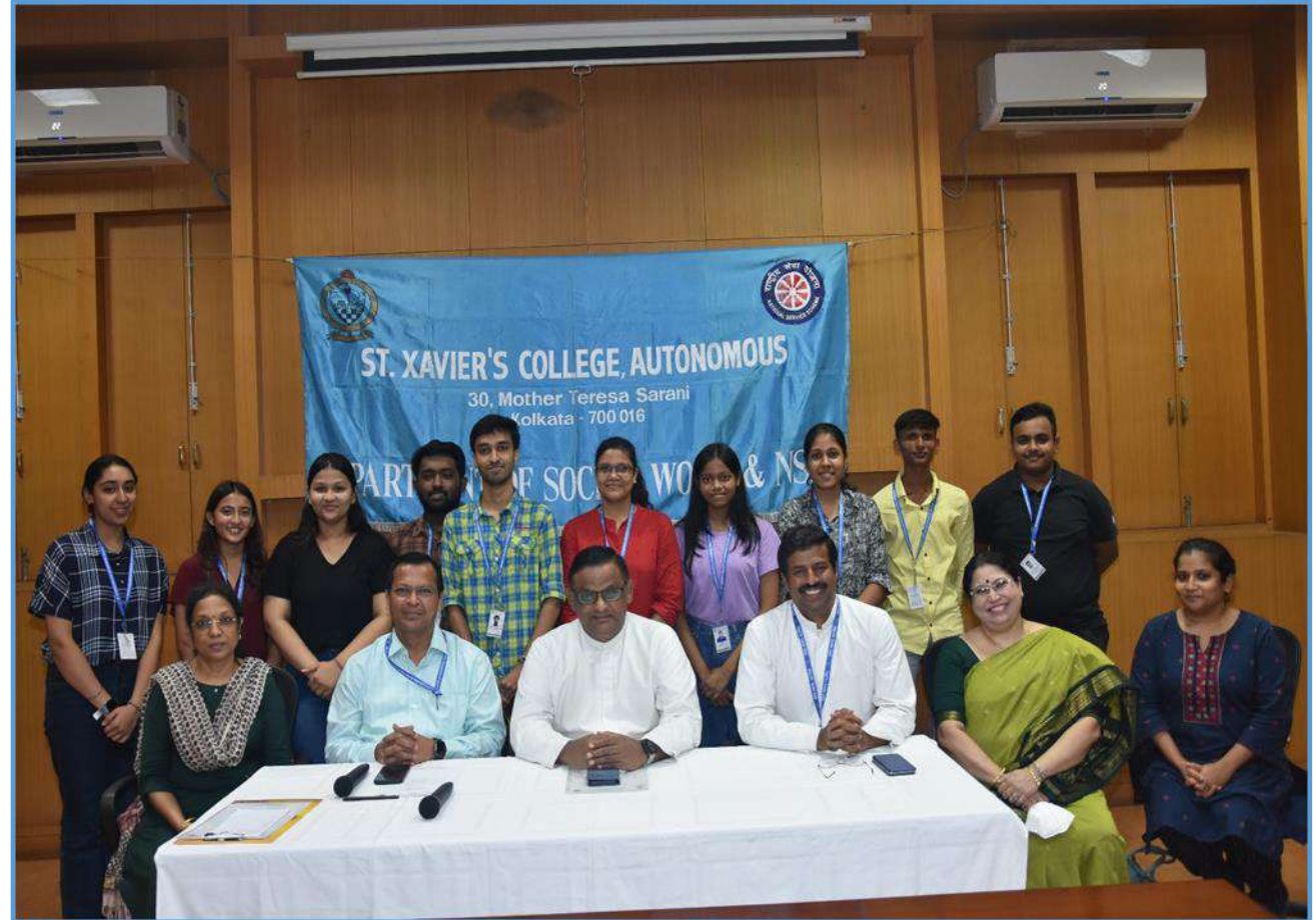
NSS Board 2022-23 with the dignitaries

30, Mother Teresa Sarani, Kolkata - 700 016, Phone : 2255 1210 e-mail : socialworknss@sxccal.edu