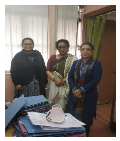
UBA coordinator with the Chairperson (middle)