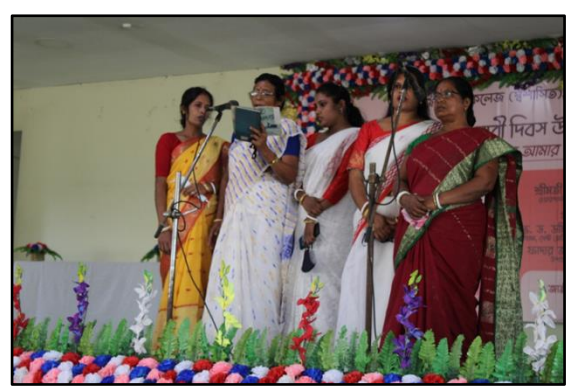
Cultural performance by the participants from the villages