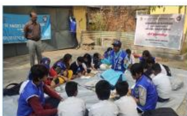
The volunteers instructing the children before starting