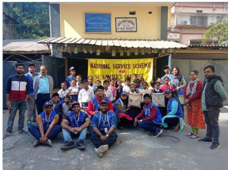
Adda session underway