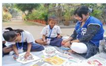
The volunteers appreciating the children