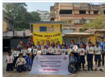
All volunteer teachers proudly showing their students' work