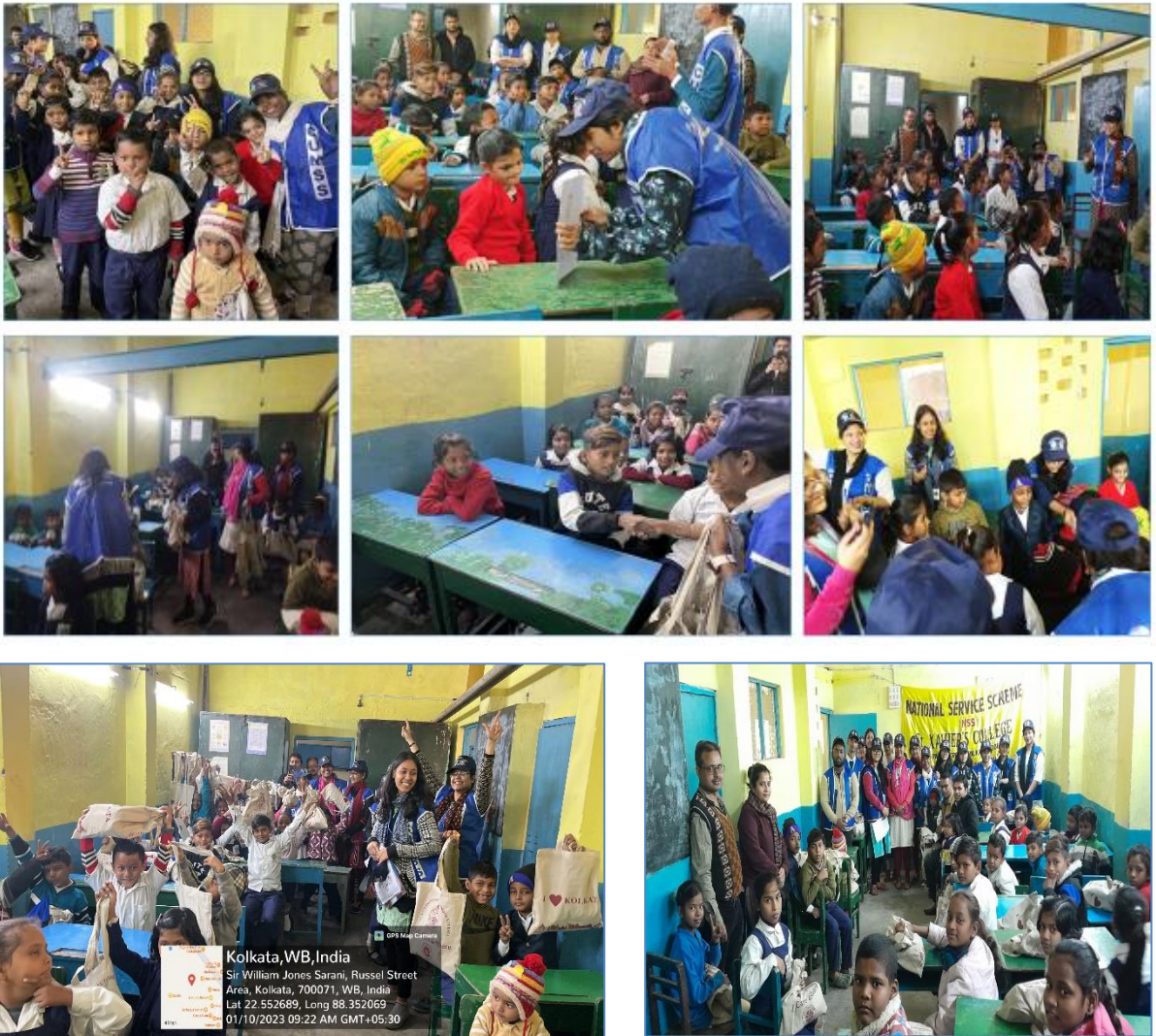
NSS volunteers with the children of Sri Gandhi Vidya Mandir