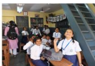
The children and volunteers sharing the joy