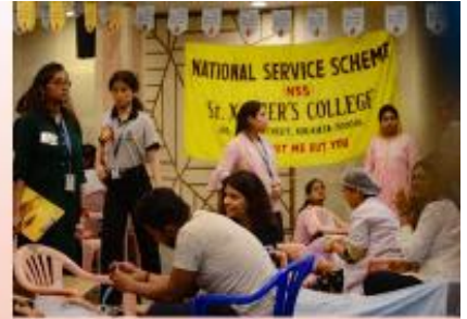
Fr. Principal, Vice Principals and faculty members – the motivating force behind the camp