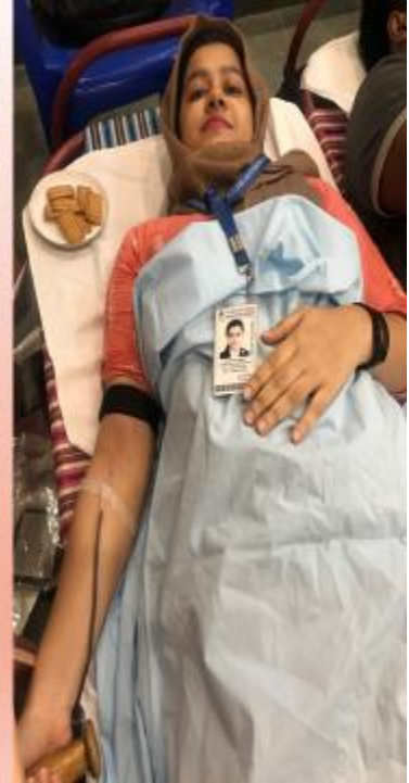
"We are One in the Spirit..."