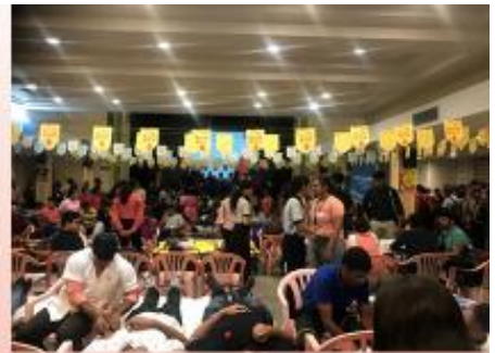
Enthusiastic donors from the Commerce Morning department beginning the camp