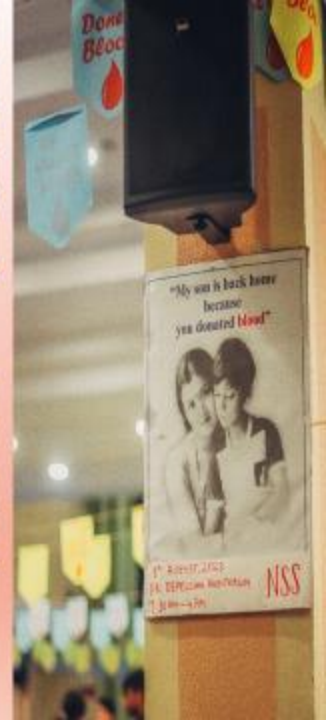
NSS Volunteers on their toes....