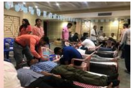
The true spirit of a Xavierian!!!