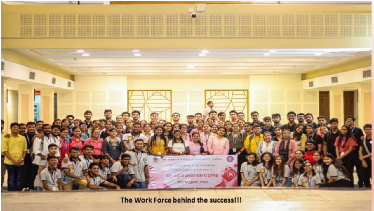
The Work Force behind the success!!!