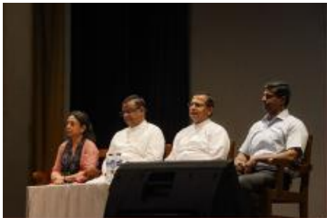
Inaugural session of the Blood Donation Camp 2023