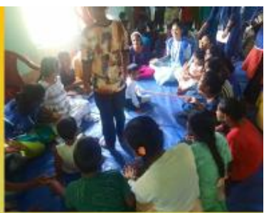
Establishing new bonds - Xaverians and the little children